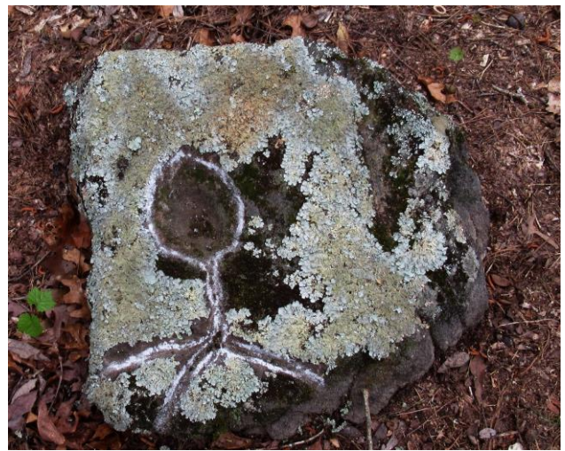
GA Healing Site Rock

I mentioned in the last newsletter how we are now learning to use Native Science in our mapping of sacred sites. In the last newsletter, I showed some site artifacts that are associated with healing sites. We visited one more site after the last newsletter had been published. This one is in GA. The healing site in GA had the identical carved rock that we found in AL and KY.