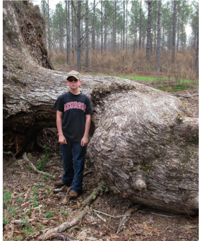
GA Ceremonial Tree