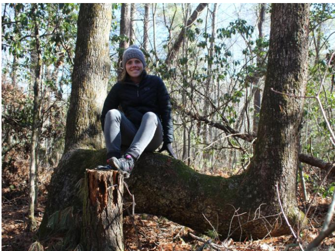
NC Cherokee Trail Marking Tree