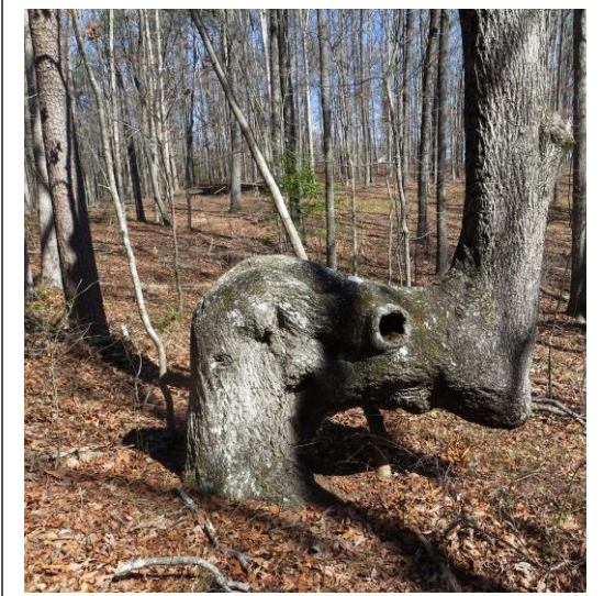
27 Inch Diameter GA Tree