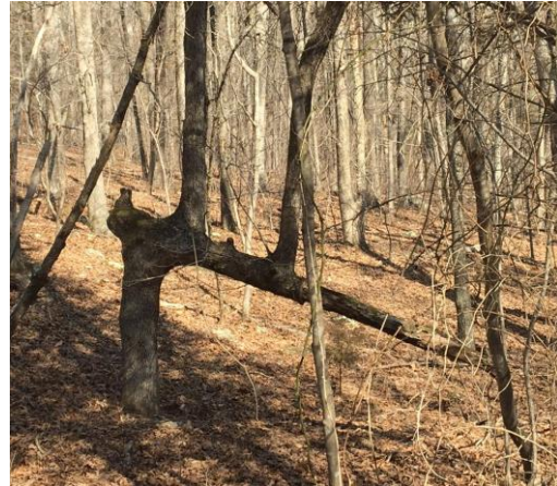
AR Grave Pointer Tree

The second tree from AR was sent in by Nick from the far NW corner of AR. This tree is believed to be marking a water source.