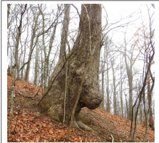
43 Inch Diameter GA Tree

Paula is one of our newest researchers in GA and has assembled a team of folks to join her in the search for the Marker trees. I'm going to include three trees that Paula's team have found that have been sitting in plain sight for years only to have been found recently. The 1 st tree was located in a forested area. The purpose was determined to be marking two graves. The double vertical limbs indicate it is marking the location of two graves. There are also two appurtenances on the hip of the tree to signify two graves. The 2 nd tree found by Paula is a typical configuration for marking a trail or water source. However, this tree is marking four graves which may have been put in front of the marker after it was bent since it is not the typical configuration for four graves.