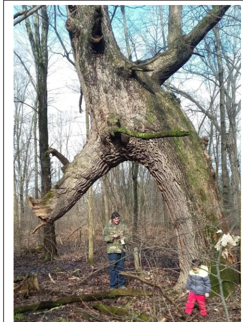
44.6 inch Ohio Tree

This summer, we will be traveling in NM and CO to document many Indian sacred sites in those two states which we have not previously visited. We will also be doing more research on Indian burial marking trees to learn about the similar configurations used by the various tribes.