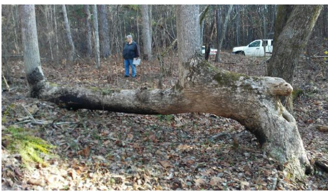
GA Tree Marking 2 Graves