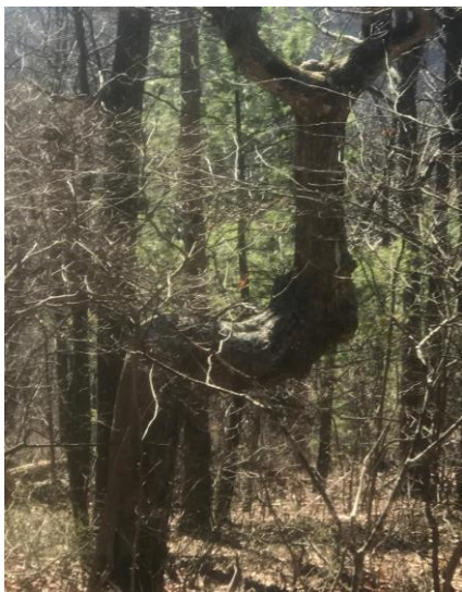
Appalachian Trail Marker

Paula's third tree find is located on the Appalachian Trail. The "Y" configuration of the tree may be indicating the trail going in both directions or related to some other interpretations regarding trail direction at that location. Many marker trees have been found on the Appalachian Trail which indicates it was an Indian Trail