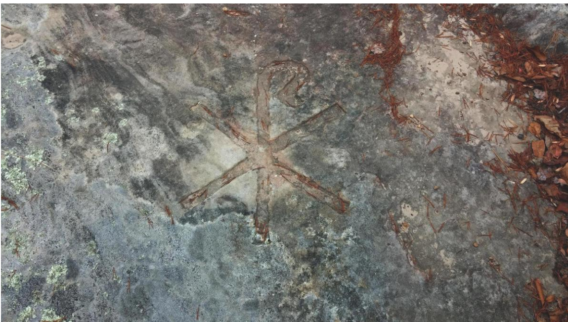
Rock Symbol near Cumberland River