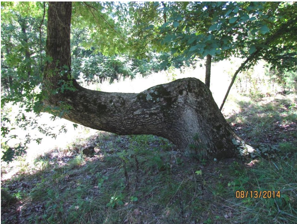
Arkansas Tree – Bilgischer's