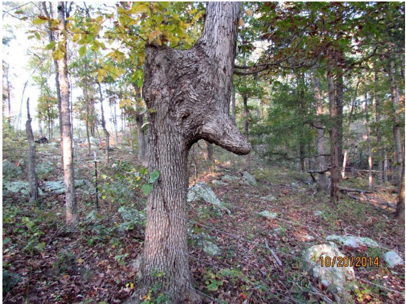
Arkansas Tree – 21 Inch diameter

Thirty five miles to the west of Cindy's tree, two large diameter marker trees were reported but have not yet documented into the database.