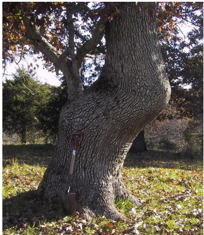
Missouri Tree – 34 inch diameter