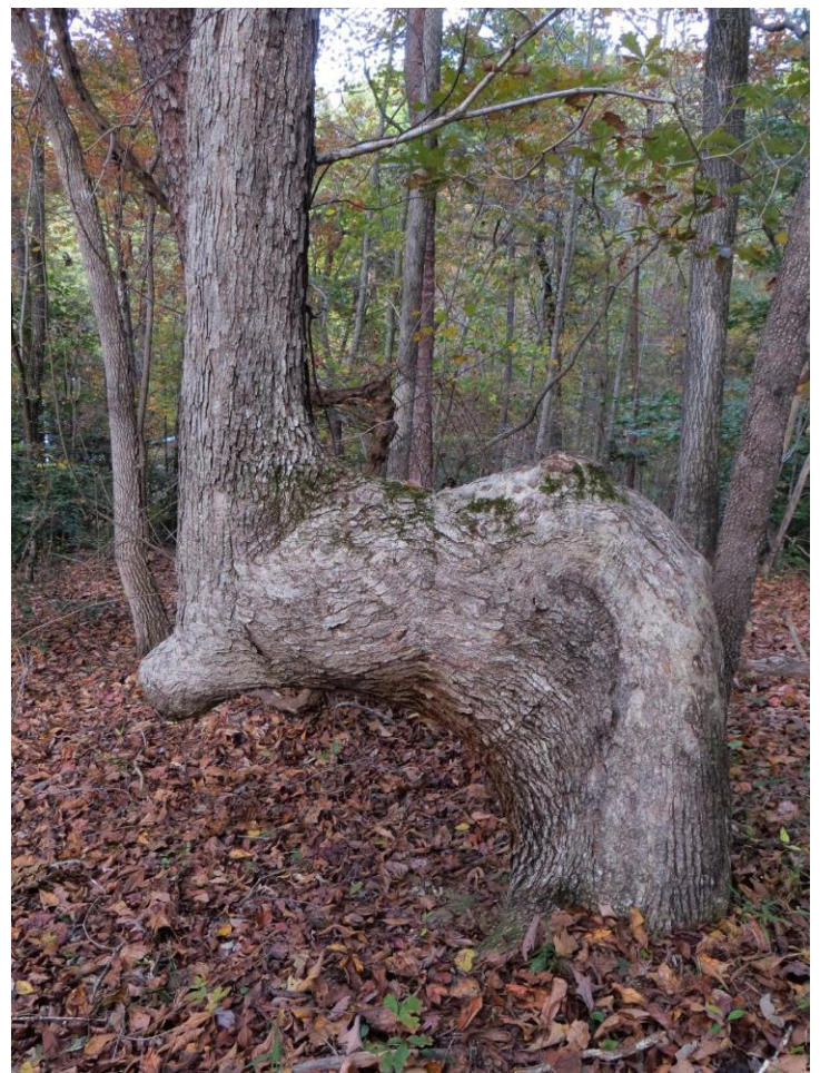
Georgia Tree – 21.5 inches in diameter