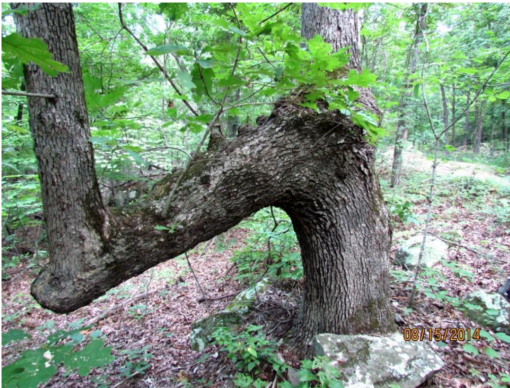
Arkansas Tree – Cheryl's